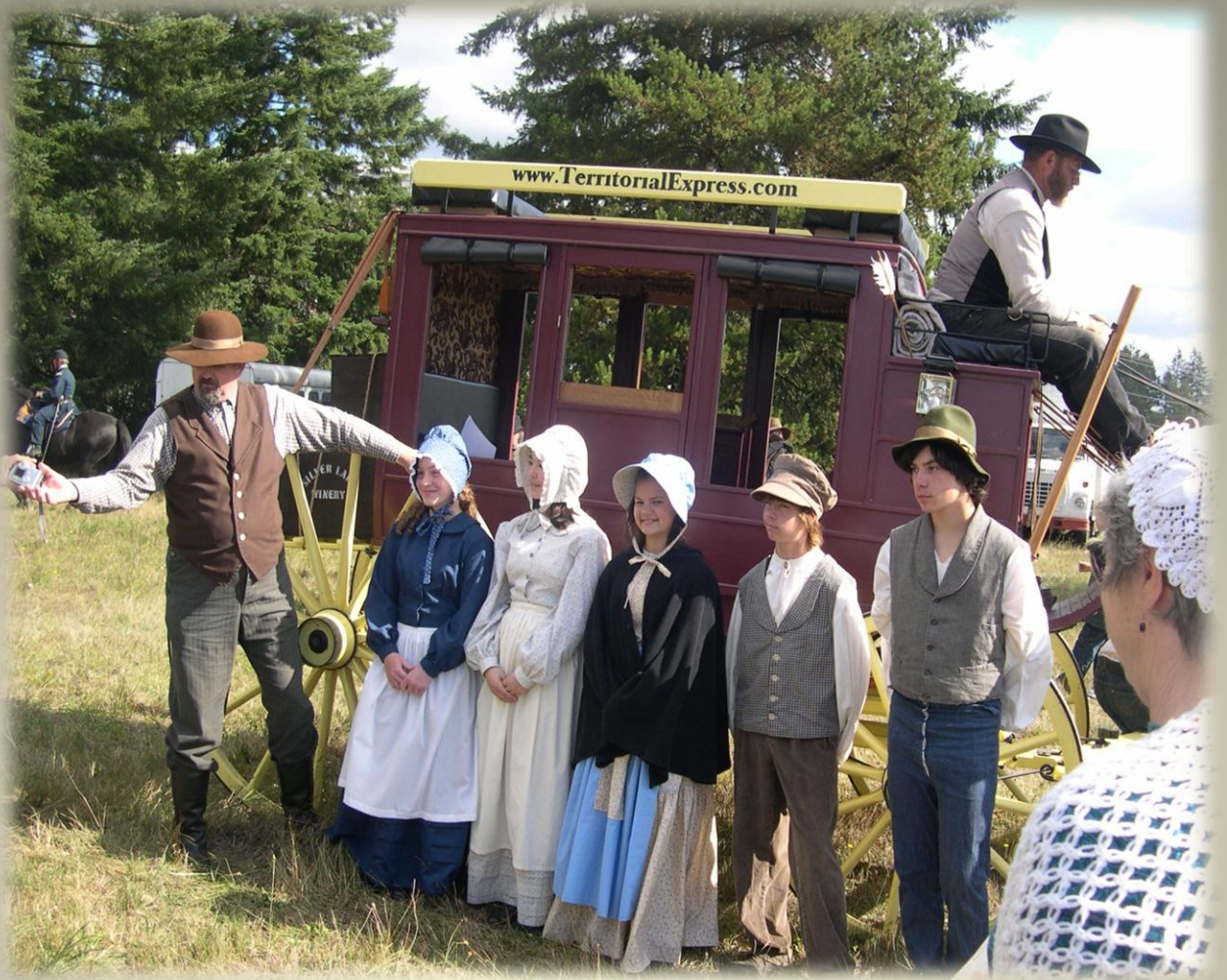
Homesteaders Posing Before the Territorial Express