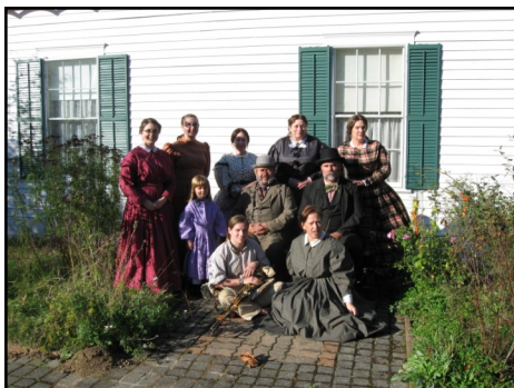
Troup of Re-enactors

—September, spent celebrating Cordelia's birthday with games of crochete and